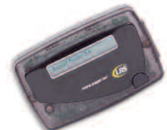
Rechargeable Alpha Pager