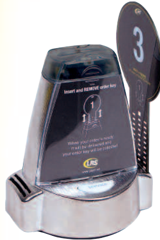
Key Call Table Unit