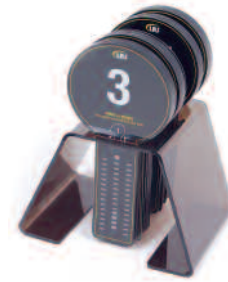
Key Holder with Keys